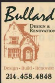
Ron Bullard, Owner

Adults have plenty of options, too. Women, in particular, will enjoy the pampering of The ShāNah Spa, which is steeped in the Native American traditions of the Pueblo tribes. Treatments incorporate natural